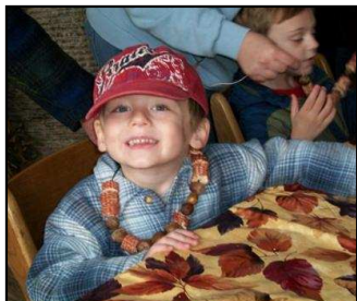
The kids loved the bunny too!